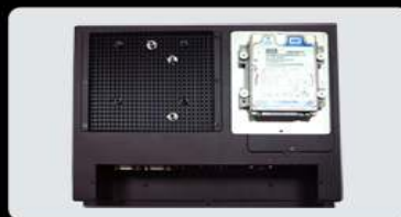
HDD Anti-vibration Easy-install Kit