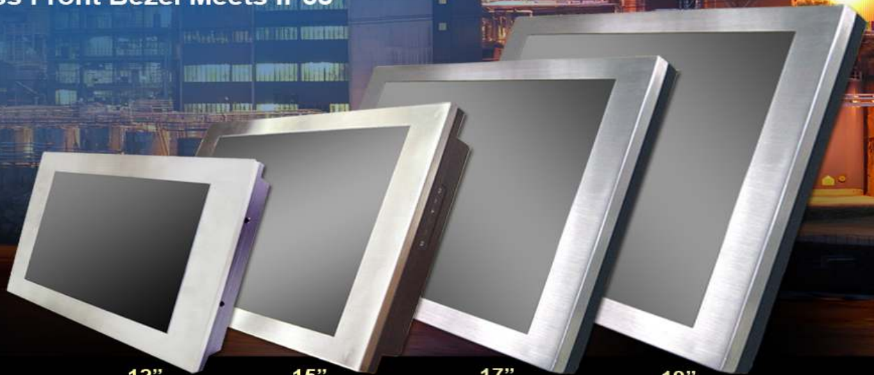
12" PT-120PFN270 15" PT-150PFN270 17" PT-170PFN270 19" PT-190PFN270