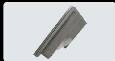
Ultra Slim Design